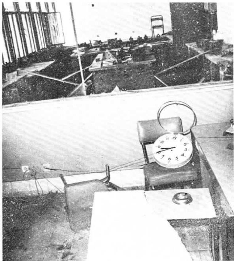
The factory's offices, after Thursday's raid by Israel.