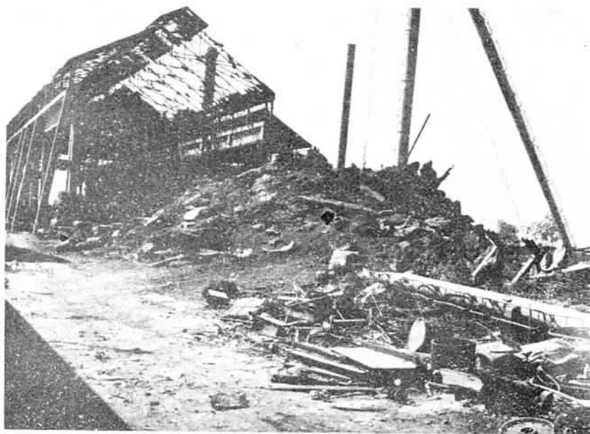
1. Destruction and loss in the wake of Israel's air raid on the National Metal Products Factory near Cairo.