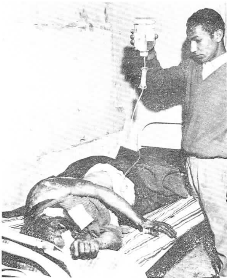
Glucose to the victim of Israel's napalm bombs.