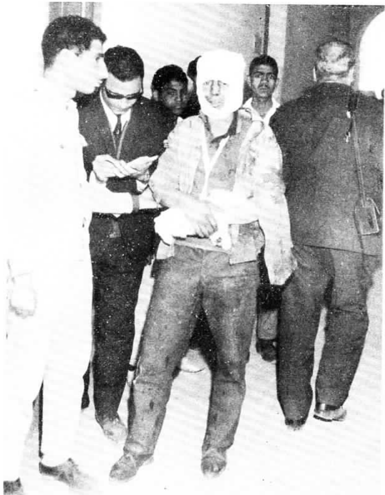
Members of the press, asking one of the wounded workers about the destruction that befell his factory.