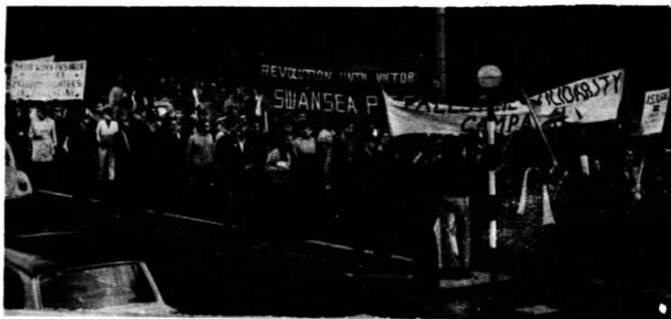
PART OF THE MASSIVE DEMONSTRATION THE PSC HELD IN MAY