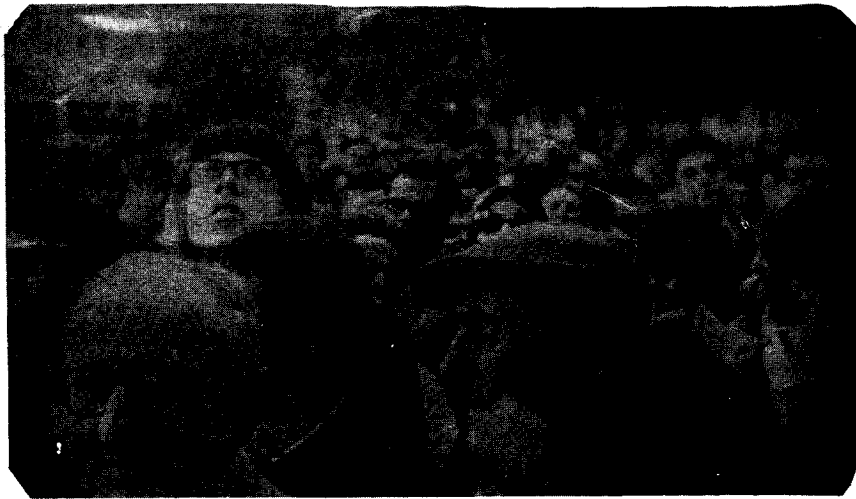
Part of the large crowd gathered round the Palestinian stand

One Sunday in April this year, a small group of students ventured out to Speaker's Corner to speak on the case of the Palestinian people. The reception was varied, with stages from the sympathetic to the openly hostile. On leaving that day the idea was born and formulated along the line that here was an audience, which, although containing a large hostile element, was at least a guaranteed weekly audience.