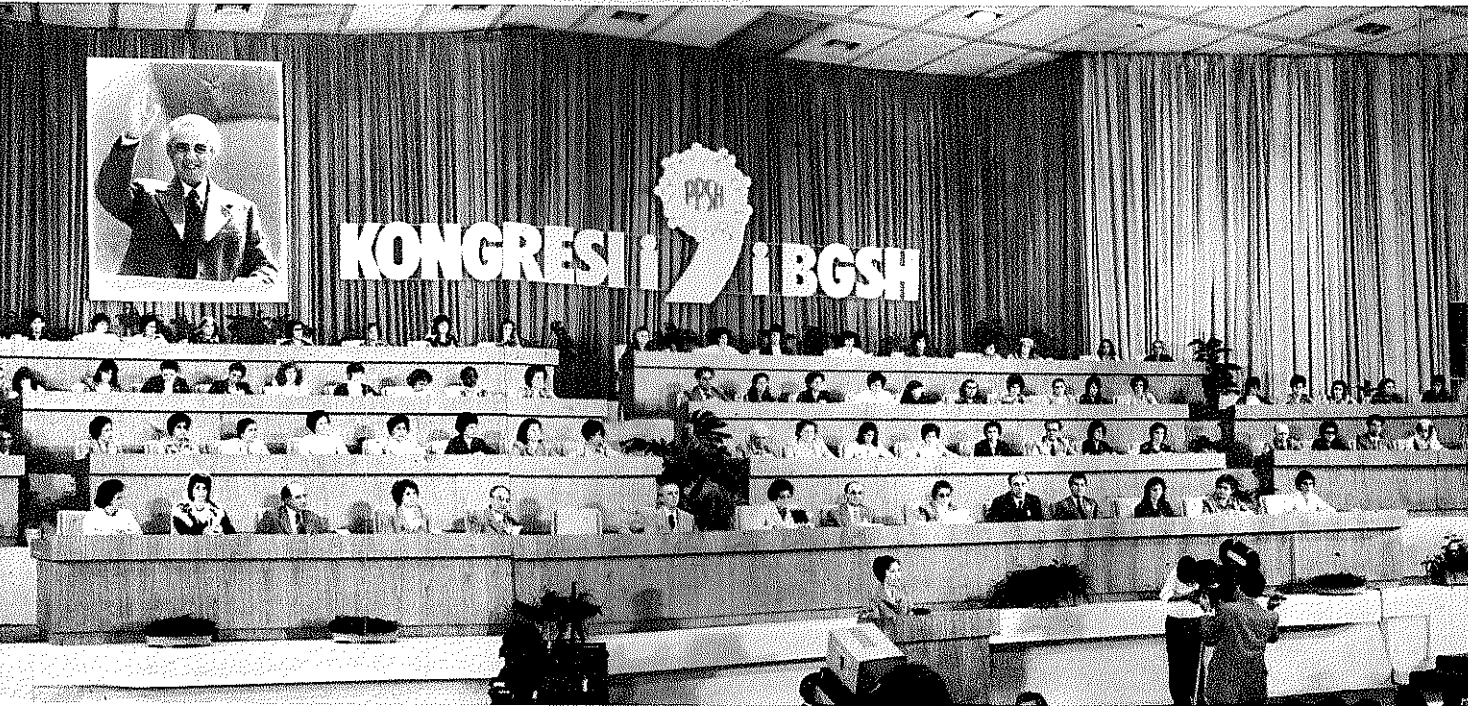
Congress of the WUA