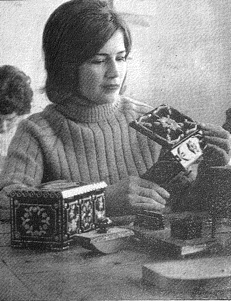
Fine articles turned out by the hands of the gifted young women and girls in the artistic enterprises.