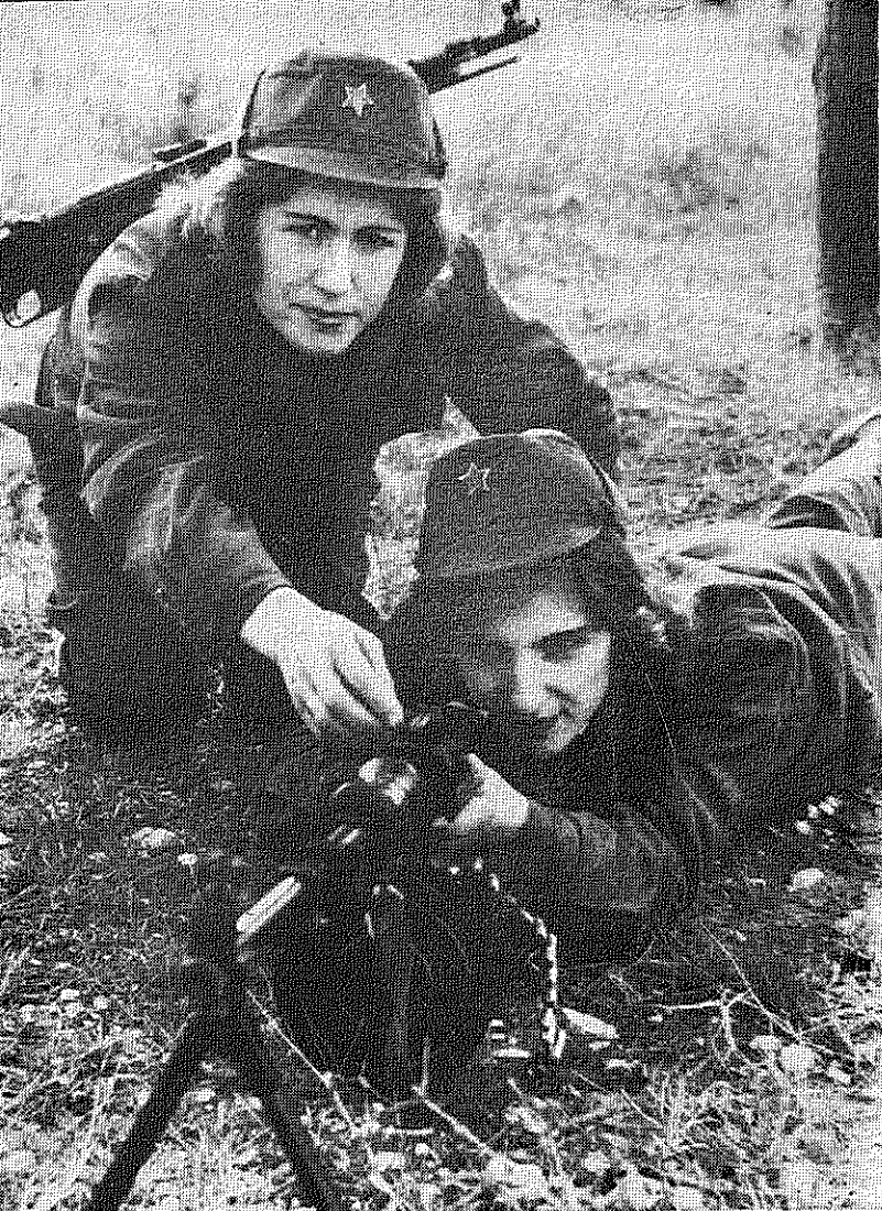
Ready to defend their free socialist Homeland.