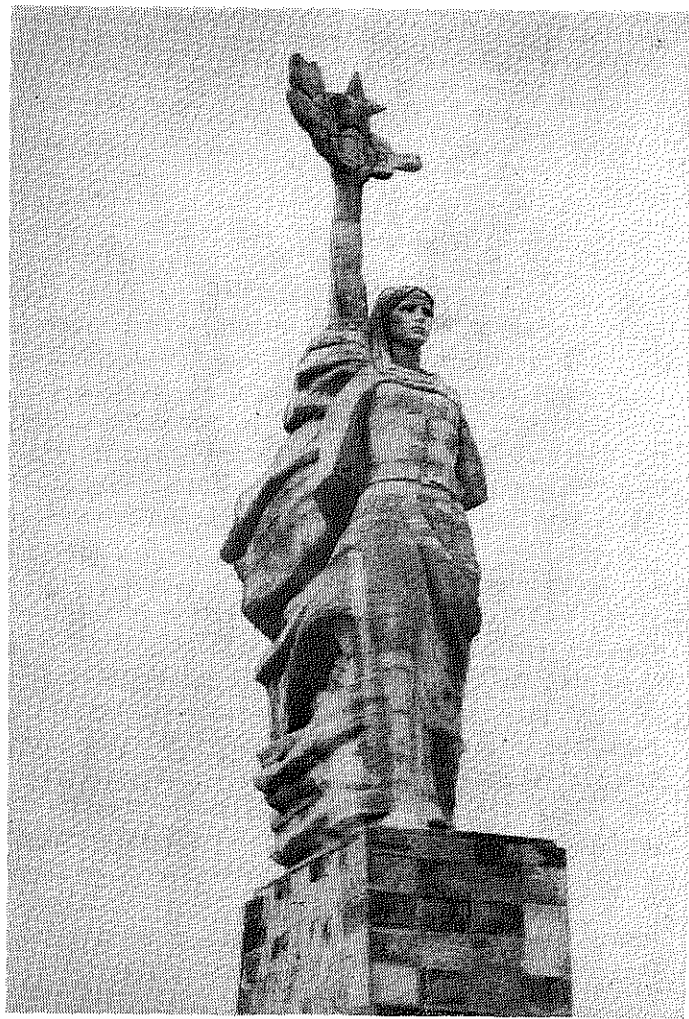
Mother Albania — a monument at the Cemetery of the Martyrs of the Homeland in Tirana.