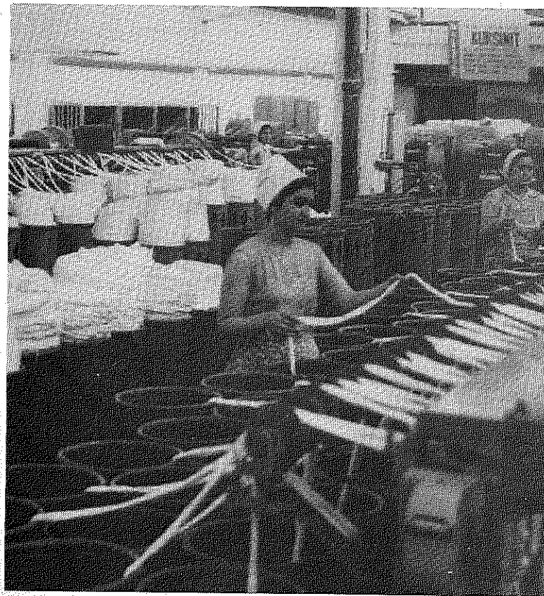
In the textile industry the overwhelming majority of working people are women.

It is the tradition of our fine arts, just as of our literature and folklore, to represent women as beautiful and proud, unyielding in the face of difficulties, ardent patriots and champions for progress, loyal wives fighting shoulder-to-shoulder with their husbands, and tender mothers. On the contrary, aristocratic and bourgeois art have always slung mud at the woman, treating her as a weak creature, as a toy to embellish their parlours, or as an object of sexual pleasure. The bourgeoisie and revisionism utilize the figure of the woman in art as a means to transform artistic creativeness into market commodity and as a means of degeneration. «In Europe and in the world,» comrade Enver Hoxha says, «there are philosophers and innumerable writers who have raised the superiority of man over woman to a myth. According to them man is a fighter, he is stronger, more courageous, and more intelligent than woman, hence he is predestined to rule, to direct. Whereas the woman, on her part, because of her very nature, is weak, defenceless, lacking in courage, hence she must be ruled and directed. Bourgeois theoreticians such as Nietzsche and Freud, have made up the theory of male activeness and female passiveness. This reactionary and anti-biological theory leads, as it actually did, to nazism in policy and sadism in sexology.» The reactionary ideas of these «men of letters and philosophers»