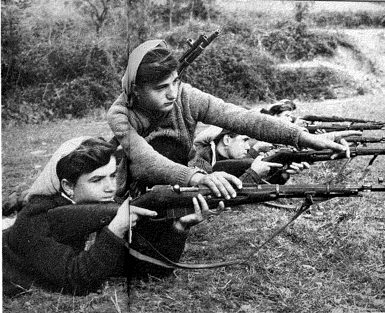
After work — military drilling.