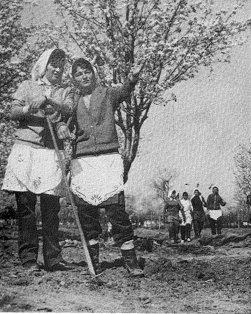
To help flourish our socialist countryside.