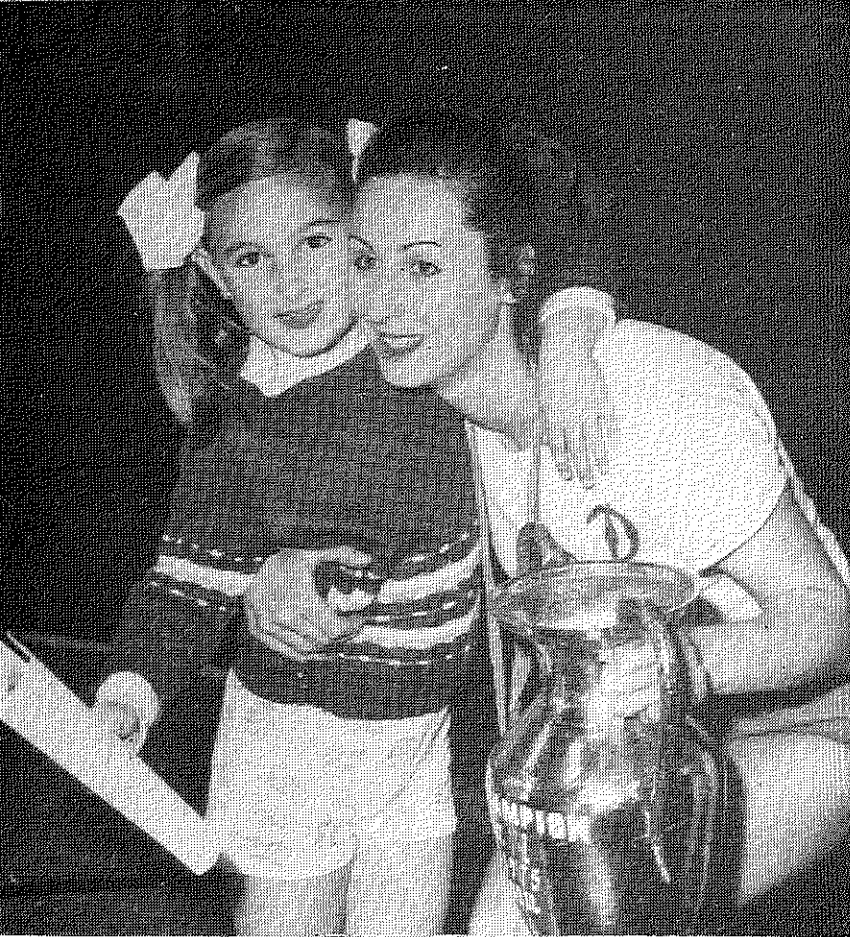
The number of girls taking part in sports activities increases with each passing year.