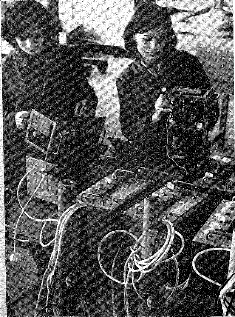
Young women learn the secrets of modern know-how.