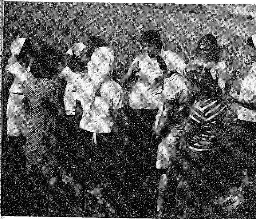
Albanian women — active participants in the life of the country. They can be found at various leading posts of the Party and State.

of the National Liberation War, of the efforts we made after the liberation of the Homeland for the setting up of the People's Power and for its strengthening. Today, just as then, whether in production work, at school, on the stage, in the camps of military training and drill, we fight for socialism, for our own emancipation, in particular».