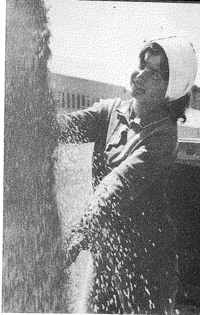
The joy at the new wheat crop...