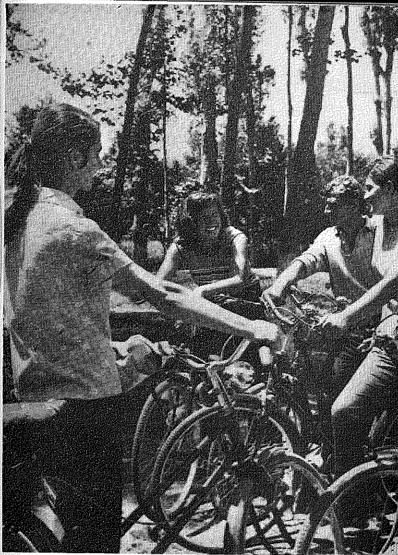
After work, a stroll round the cooperative.