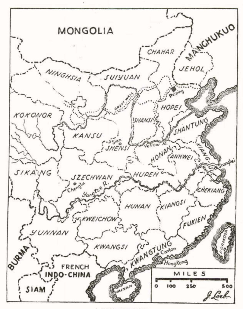
A MAP OF CHINA