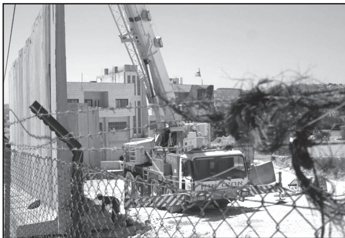
Land grabs and ethnic cleansing continue with the building of the Wall, deemed illegal by the International Court of Justice and the UN

Palestinians killed, at least 1,483 of them civilians, including at least 490 children, with many thousands more injured and an estimated 20,000 homes destroyed. The Israeli deaths totalled 71, of which 66 were soldiers. Israel has blocked the entry of building materials, fuel and other essential goods since the onslaught in 2008/9 and the damage to infrastructure is such that now (April 2016) over 90% of the water is undrinkable.