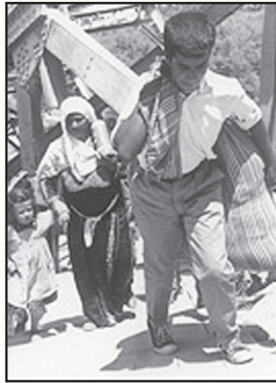
Refugees crossing the Jordan river in 1948

It was much the same in Jaffa and in Safad in the Galilee, where 9,500 Arabs and 2,400 Jews had lived; the entire Arab population was driven out. Similar stories were repeated throughout Palestine. By the time the