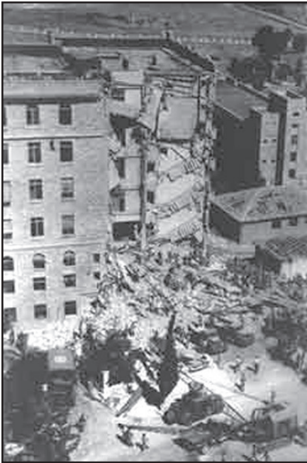
The King David Hotel in Jerusalem, HQ of the British army, bombed by the Irgun gang in 1946. 91 people died.

of peaceful coexistence was unattainable and that partition was unavoidable. In 1939 Britain confirmed its withdrawal from the Balfour Declaration and undertook to limit Jewish immigration and land purchase. The Zionists reacted with ferocious violence, now against the British as well as the Palestinians.