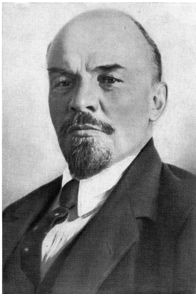
V. I. LENIN 1918