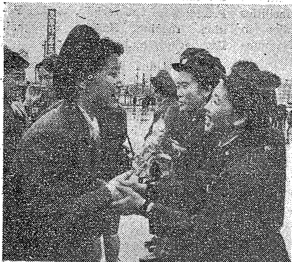
Korean artists who serve in the People's Army greeting members of the P.L.A. Song and Dance Ensemble.

A snow-covered range stretches in a continuous line in the northern part of Nepal. It has more than 240 peaks with an altitude of over 6,100 metres. All of the world's ten highest peaks, with the exception of the 2nd and the 9th ones,