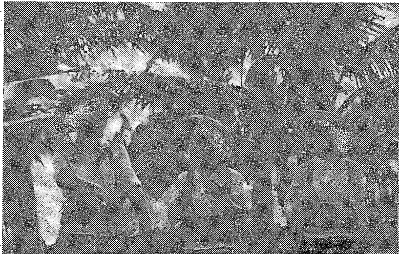
Militiawomen of the Hsisha Islands.

The Hsisha Islands are lovely, but more lovable are the people who have been tempered in the Great Proletarian Cultural Revolution and are working day and night to build up these islands. Among them are fishermen who have fished in those waters for generations, young women of the sea fishing fleet making their debut in these fishing grounds, heroic army-men and civilians indefatigably guarding and constructing the islands, as well as scientific workers from all parts of China engaged in mapping and surveying the islands. Typhoons which are common in these parts sometimes cut off communications for days on end, and fresh water is scarce on the islands. But, braving the tempestuous storms and the scorching sun and surmounting all kinds of difficulties, army-men and civilians, who are on guard day and night, are working hard to build up the islands. By their concrete actions in grasping revolution, promoting production and getting prepared