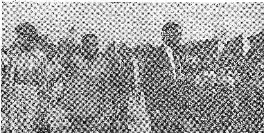
A warm welcome for Prime Minister Fraser at Peking Airport.

stand has helped safeguard Australia's national independence and sovereignty and reflects the Asian-Pacific countries' common aspirations to oppose superpower hegemonism.