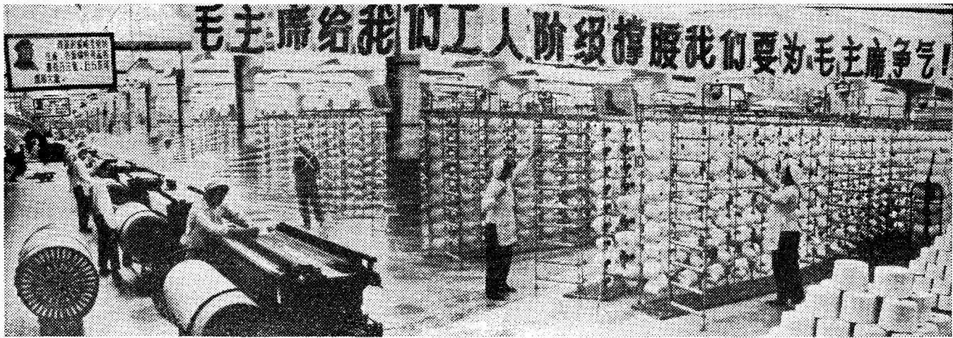
The Peking No. 3 Cotton Mill fulfilled its 1968 production plan ahead of schedule. Production goes ahead in the mill full steam.

designed, built and equipped by China went into production last year. Compared with 1966, more than twice as many new pits went into operation in 1968, and the number now under construction came to 13.4 per cent more than in 1966. By December 10, China's coal mines had done 68 per cent more tunnelling than in the same period in 1967.