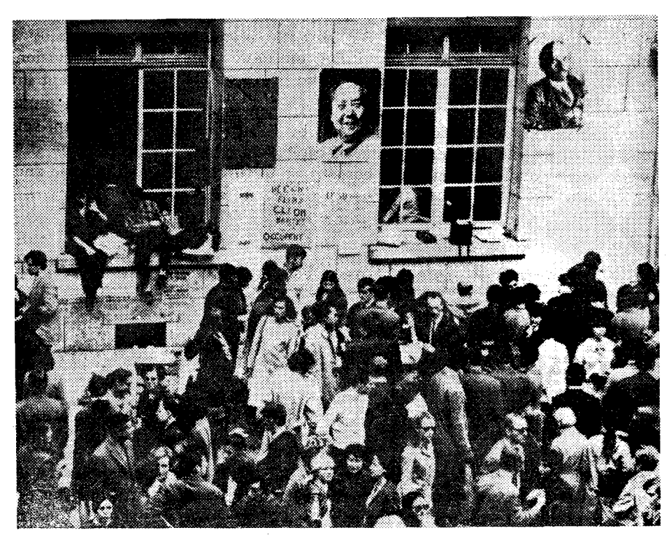
Students fight on courageously at the University of Paris where the portraits of Lenin and Chairman Mao Tse-tung, the great leaders of the proletariat, adorn the walls along with revolutionary slogans.

Far from intimidating the workers and students, these repressive measures only aroused their greater anger. The day Information Minister Yves Guena proclaimed the restrictions on mass demonstrations, students in many big cities staged powerful protest marches defying the reactionary government ban.