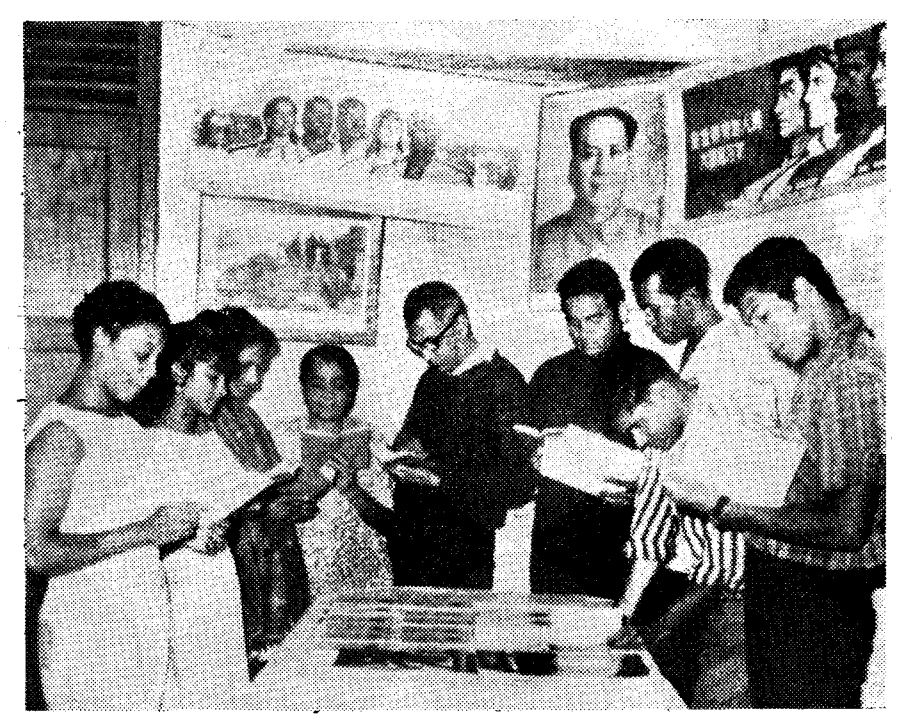
Mauritius youth reading Chairman Mao's works

He said that in these two great works, Chairman Mao has criticized the viewpoints that under given historical conditions, there are only contradictions between the enemy and ourselves and no contradictions among the people, or only contradictions among the people and no contradictions between the enemy and ourselves.