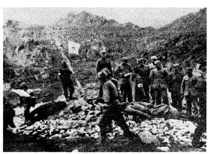
After receiving the 14 bodies and signing a list in acknowledgement, the Indian personnel carry the bodies away from China's territory.