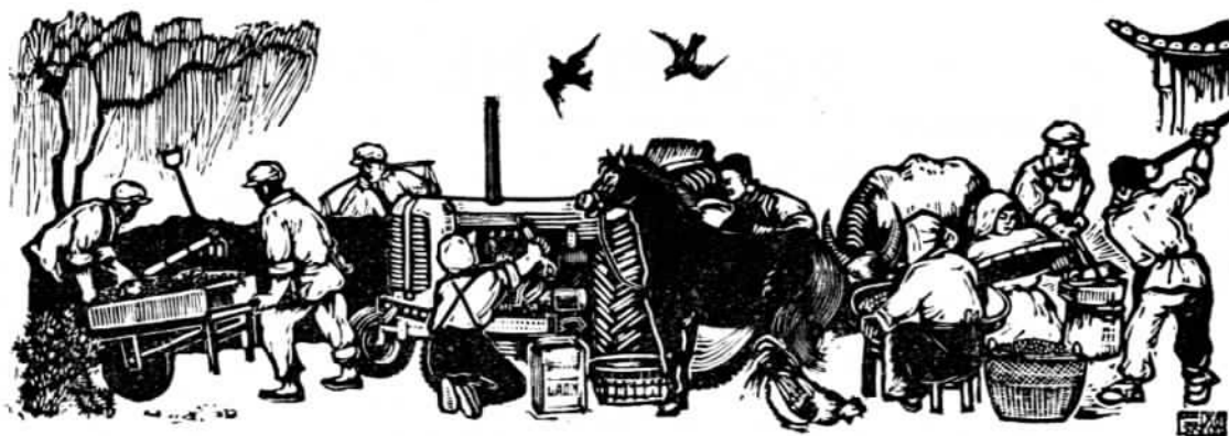
Woodcut by Tung Pao-fa

The Party's fundamental line of policy regarding agriculture is: first, to achieve the collectivization of agriculture; and then, gradually carry out the technical transformation of agriculture and modernize it on the basis of collective farming. In the course of the new democratic revolution and the socialist revolution to date, the Chinese people, led by the Party, has been dealing mainly with production relations, paving the way for the development of the productive forces. They have scored great successes in this respect. They have not only succeeded in collectivizing agriculture in a country with 500 million peasants but discovered the form of social, political and economic organization which suits present conditions in China's countryside—the people's commune. This provides an extremely favourable condition for undertaking technical transformation. From now on, while continuing to consolidate the collective economy, the nation must at the same time develop the productive forces in the countryside, carry forward technical transformation, supply agriculture with various kinds of farm machinery, chemical fertilizers, insecticides, means of transportation, fuel, power, building materials, etc., so as to build its agriculture gradually into a great modern socialist agriculture.