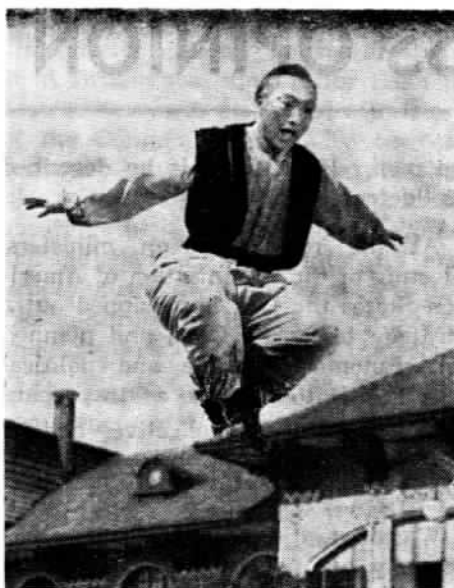
The magician in difficulties during the circus chase

It was a conjuror's toy pistol that got the magician into trouble with the Kuomintang. He forgets that such things no longer happen in New China, so when at a circus searching for his old friend, he sees the young bus conductor looking for him to return a toy gun he left on the bus, he is panic-stricken. He disguises himself in circus togs and there is some good cinema slapstick as he is chased