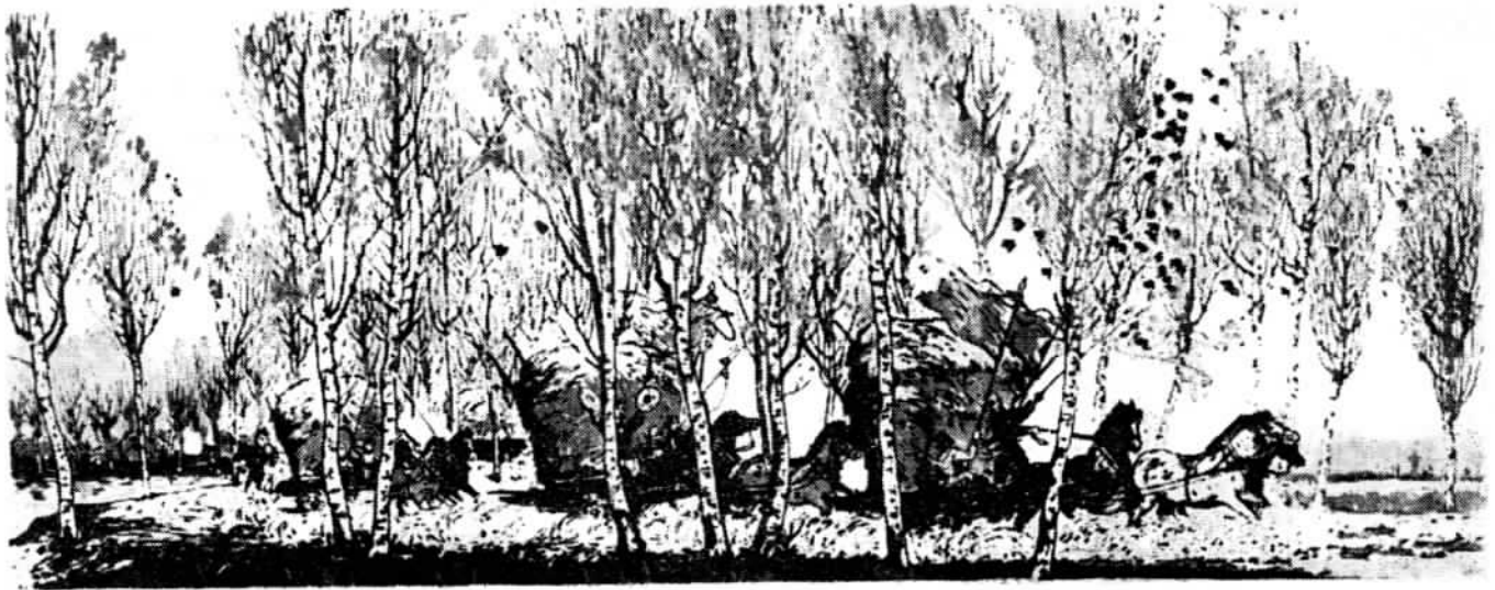
The Trees Have Grown Up