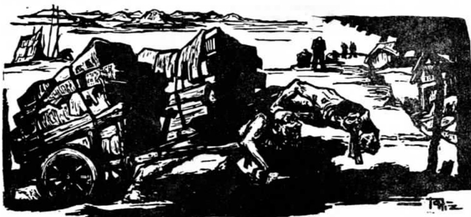
Hard Labour (1946), a woodcut from Kuomintang-controlled territory