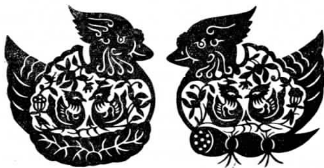
Mandarin Ducks (papercut for a windowpane)

This test was made to try out the many improvements which have lately been made on these racers. The "Happiness" is another product of the big leap; before 1958, all racing motor cycles in China were imported.