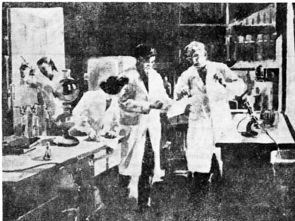
In the Laboratory