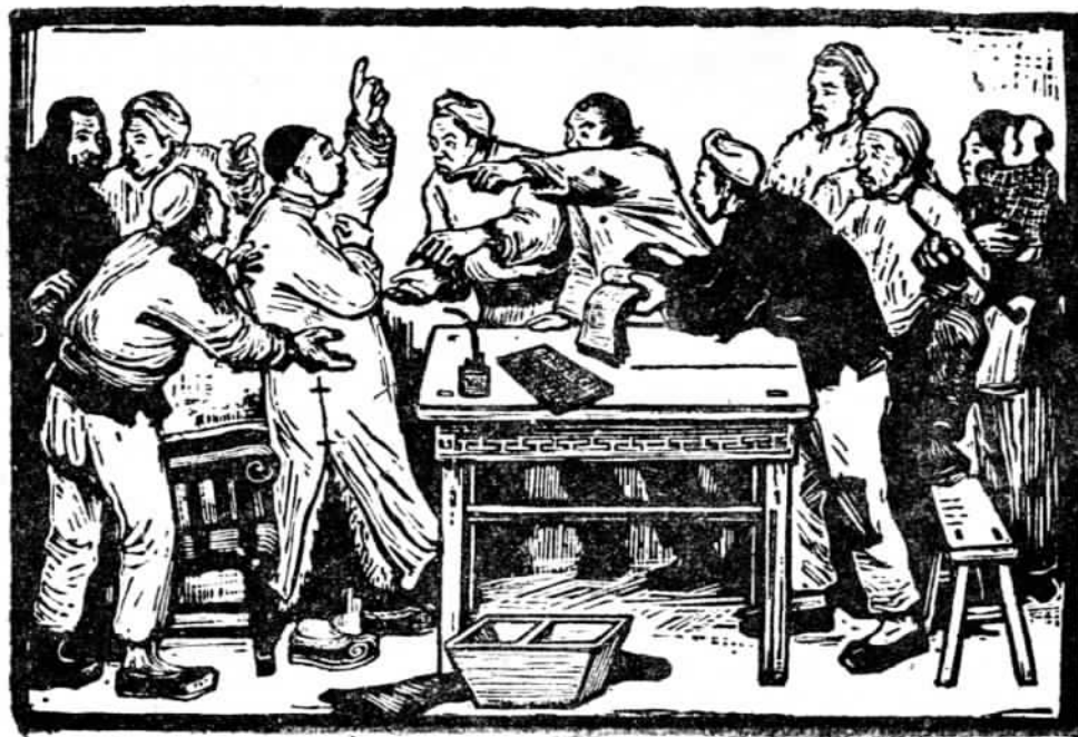
For Rent Reduction (1943), a Yenian woodcut