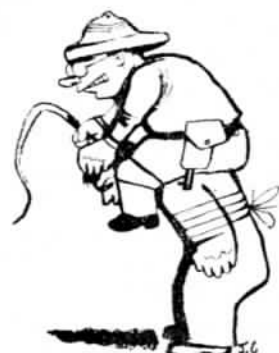
"Preserving the status quo pending negotiations"

When a colonialist sits on your neck though you've told him to get off he calls it "preserving the status quo pending negotiations." Now Dutch Foreign Minister Luns in an interview with U.S. News and World Report has a new definition of self-determination. Holland, he says, cannot return West Irian to Indonesia because this would violate the principle of "self-determination." He proposed instead "phased decolonization" to take from five to ten years.