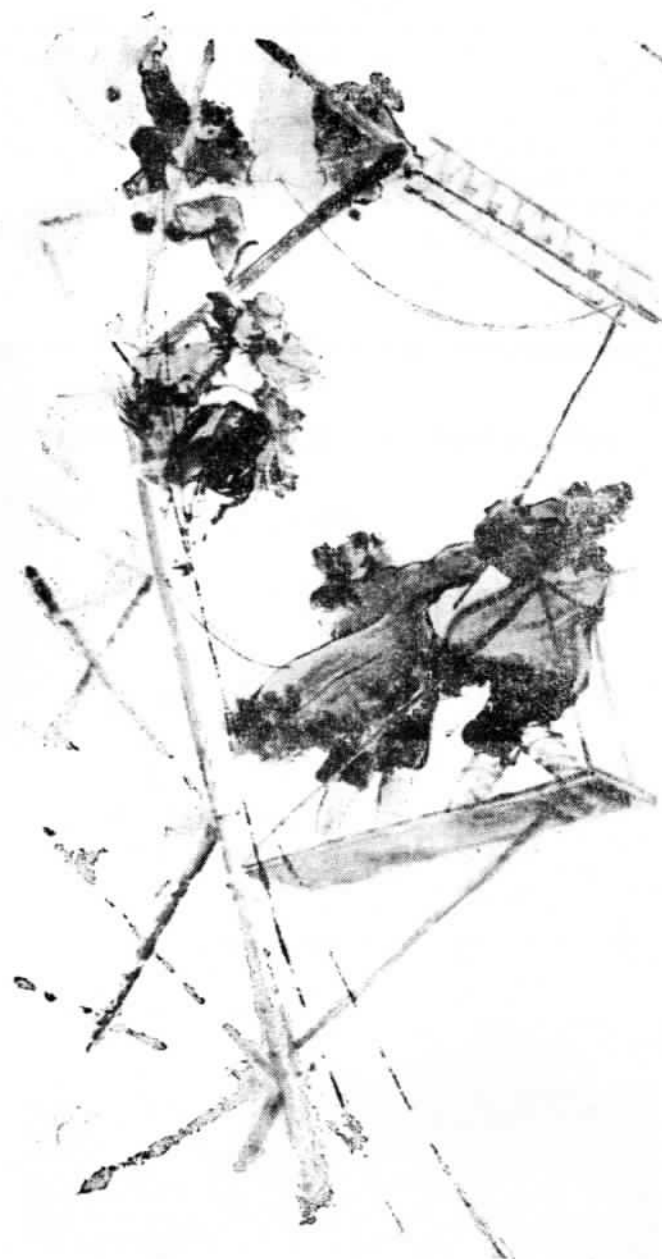
Brave Eagles on the Power Line

With drought a regular visitant of the Wei River valley lands, irrigation is essential for farming there. The Kuanchung power grid of today actually grew directly out of the fight against drought that has had to be waged there in the past few years. As a result, 2.8 million mu of land are now being irrigated with electrically operated