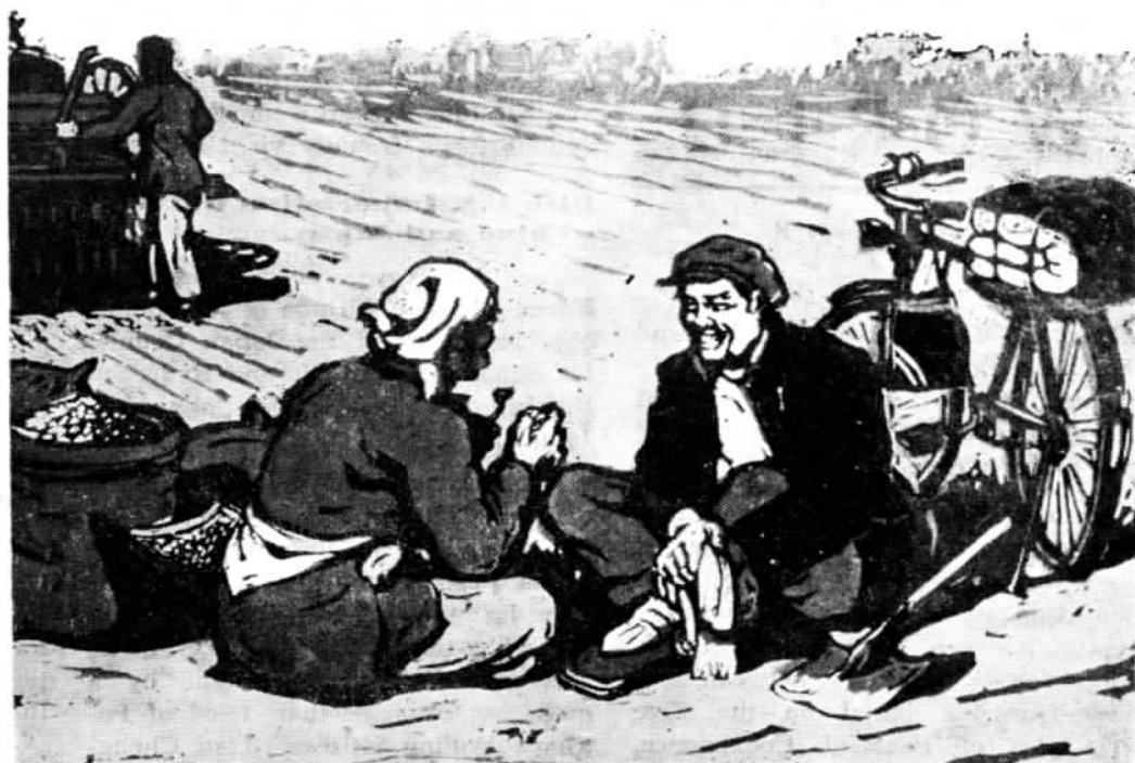
Consulting a Veteran Farmer

Advice from model farmers has from time to time prevented one-sided and impractical ideas getting official sanction. Some decisions that are basically sound have been improved after suggestions from model farmers have been considered.