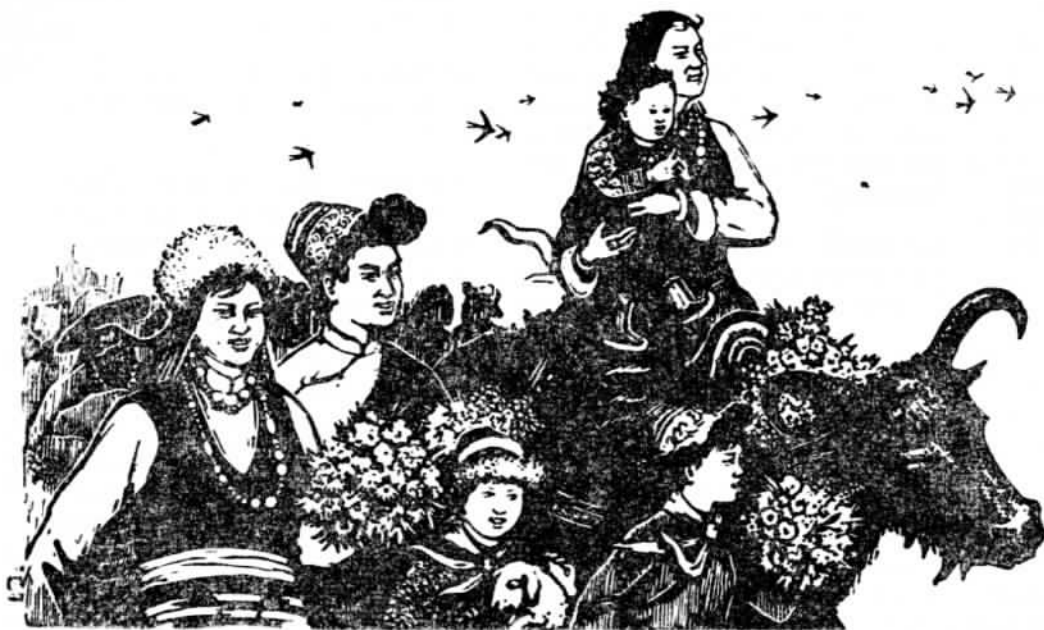
To a New Day

The Khyisum estate — a large manorial property which belonged to Surkong Wongching-Galei, a big serf-owner and a