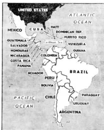
Map by Su Li

URUGUAY: The Uruguayan people strongly resisted the "austerity" plan imposed by U.S. financial organizations. Mass protests denounced U.S.-instigated assassinations of patriots.