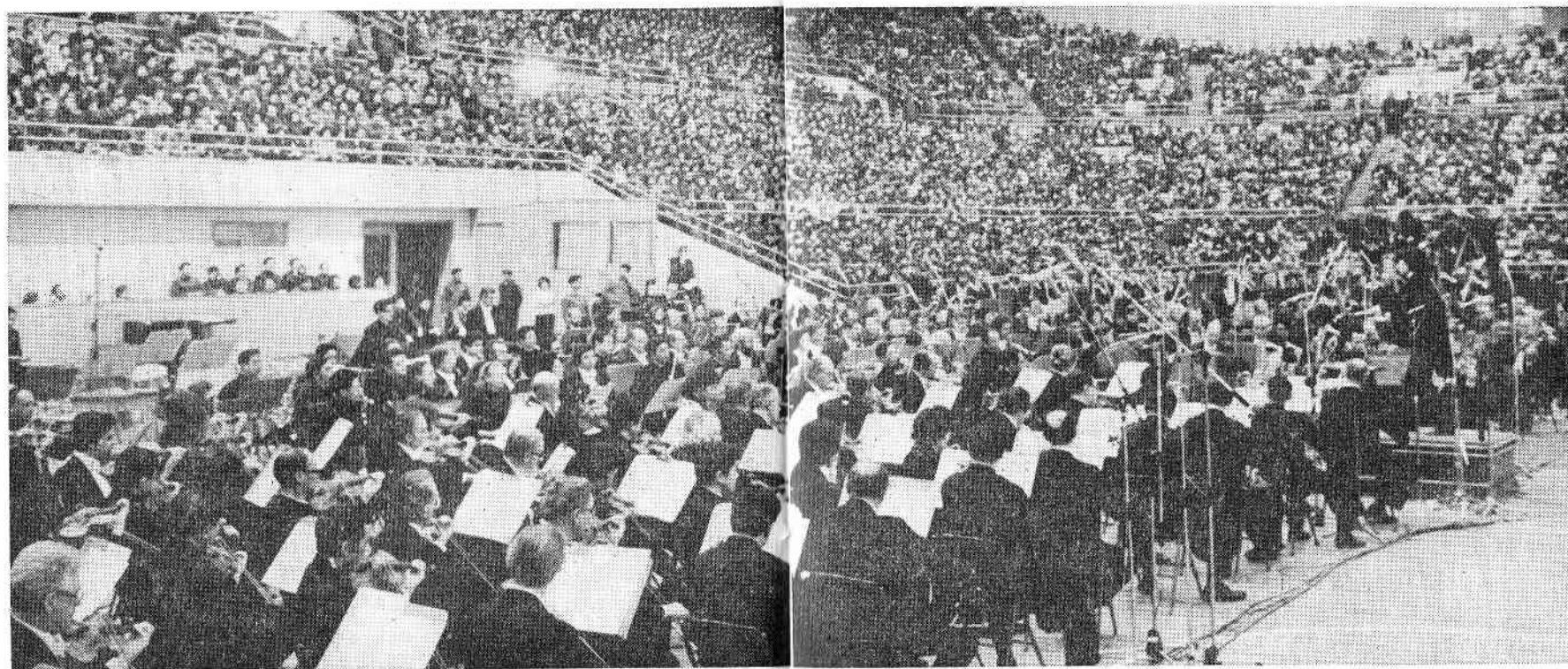
Joint performance by the Boston Symphony Orchestra and the Central Philharmonic Society

Mr. Seiji Ozawa became the conductor of the Boston Symphony Orchestra in 1973. He is a virtuoso combining passion with sensitivity and accuracy. Guided by his skilful baton, the two orchestras brought the coda of Beethoven's Symphony No. 5 in C minor to a brilliant climax. When he conducted the fourth movement of Tchaikovsky's Symphony No. 6 in B minor, he made the orchestra hold the audience spellbound; when they played the first movement, his conducting was so relaxed and unconstrained that its tenderness was brought out to the full; while the different cadences