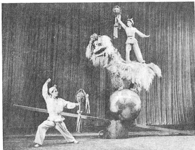
A Lion Crossing the Bridge

which they charge out from a cave, jump over mountains and streams and frolic together. These lions not only can climb, prance and walk on stakes but also stand on their hind legs with nimble precision. The subject matter is skilfully conveyed, and by adopting certain engaging features of the "gentle lions" they appear thoroughly lifelike and make a strong appeal to the audience.