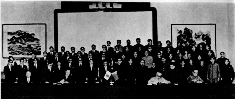
The Joint Statement of the Government of the People's Republic of China and the Government of Japan was signed in Peking on September 29, 1972