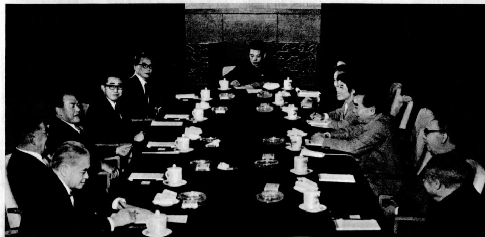
Premier Chou En-lai and Prime Minister Tanaka hold talks