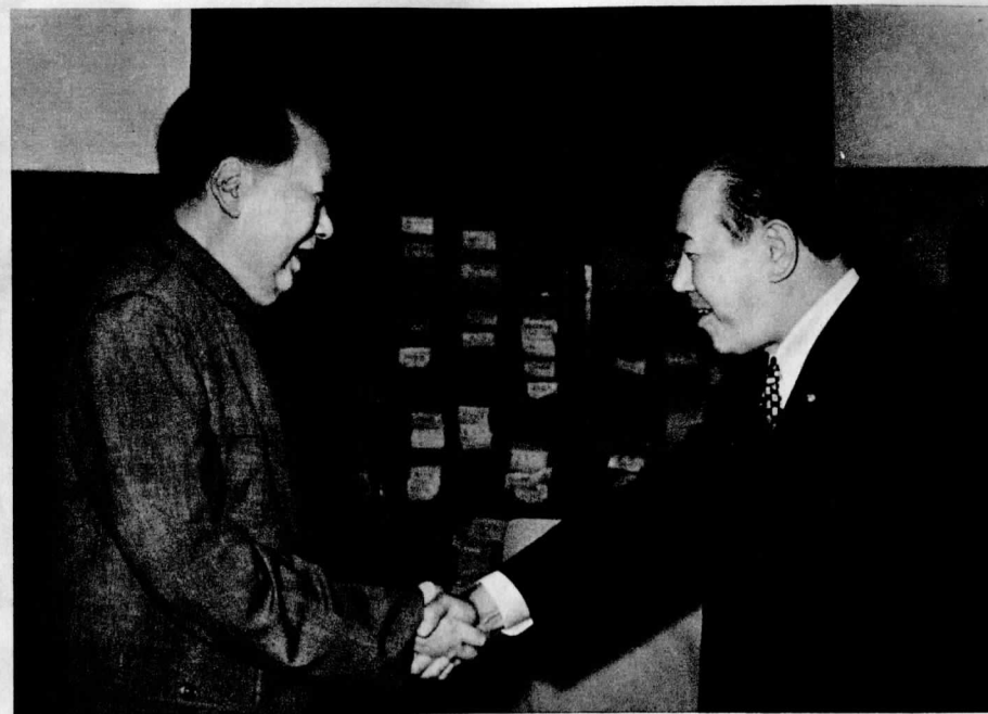
Chairman Mao Tsetung shakes hands with Prime Minister Kakuei Tanaka

Printed in the People's Republic of China