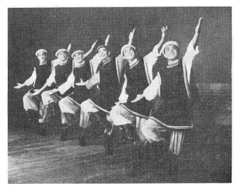
Happiness Sparkles in the Mountain Village

All these propagandists come from poor families and each has bitter memories of the time when they were cruelly oppressed by the local government, the nobles and the lamaseries. Many of them are