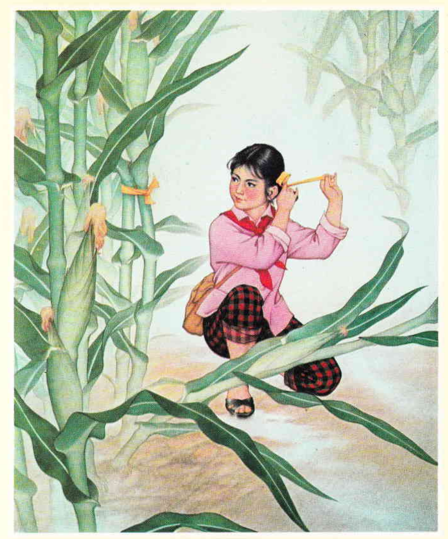
On the Way to School