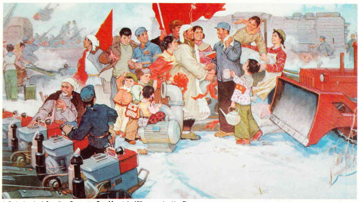
A Train Load of Supplies Comes to Our Mountain Village