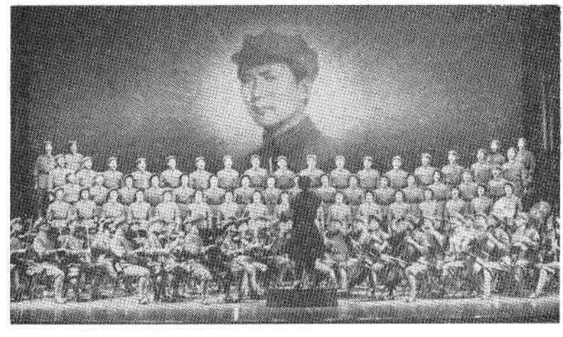
The suite of songs The Red Army Fears Not the Trials of a Distant March

A round of theatrical shows was organized by the People's Liberation Army art troupes in celebration of the 40th anniversary of the victory of the historic Long March. Included in the repertoire were the modern drama The Long March, the suite of songs The Red Army Fears Not the Trials of a Distant March, the dances Storming Luting