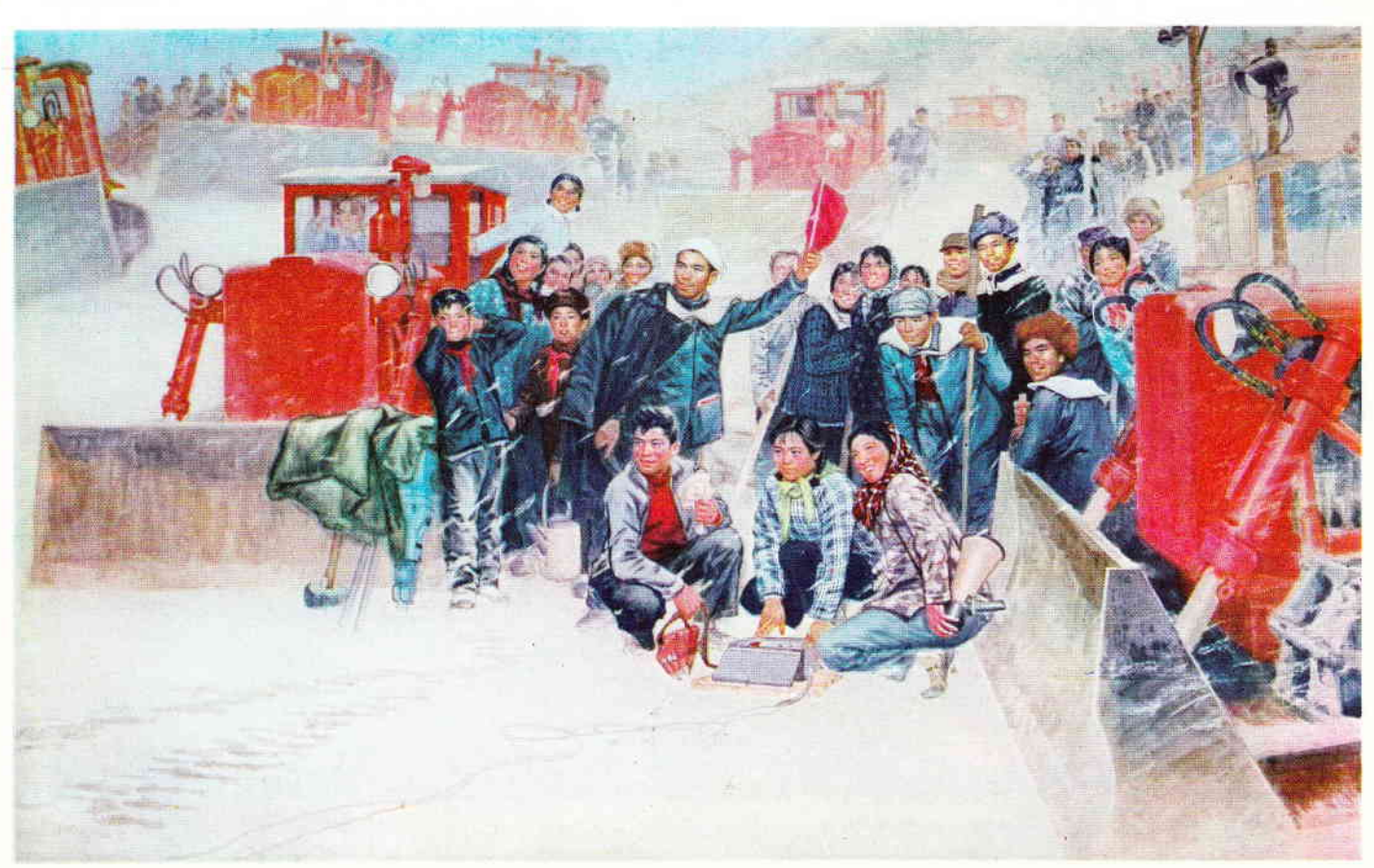
Battling on the Taihang Mountains