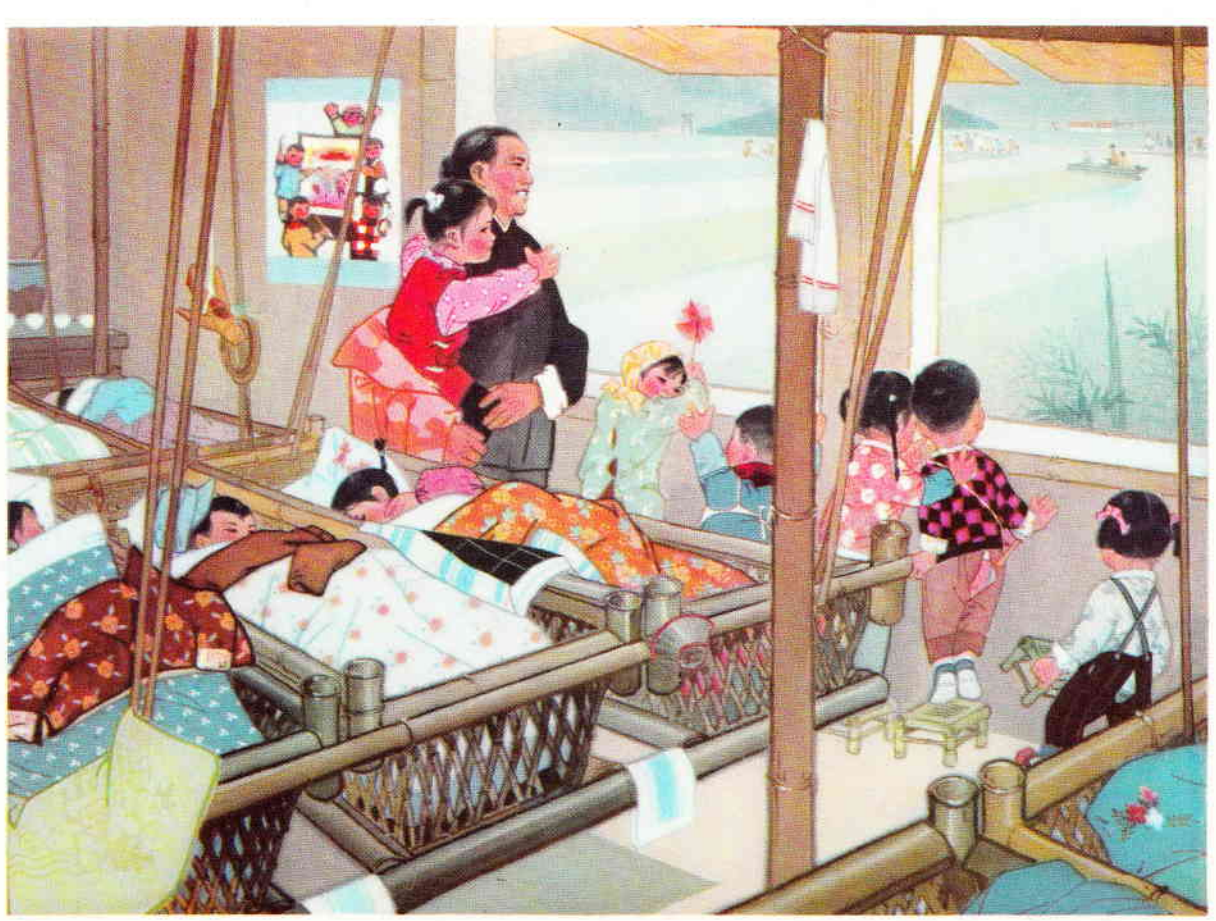
Harvest-time Nursery by Liu Erh-kang