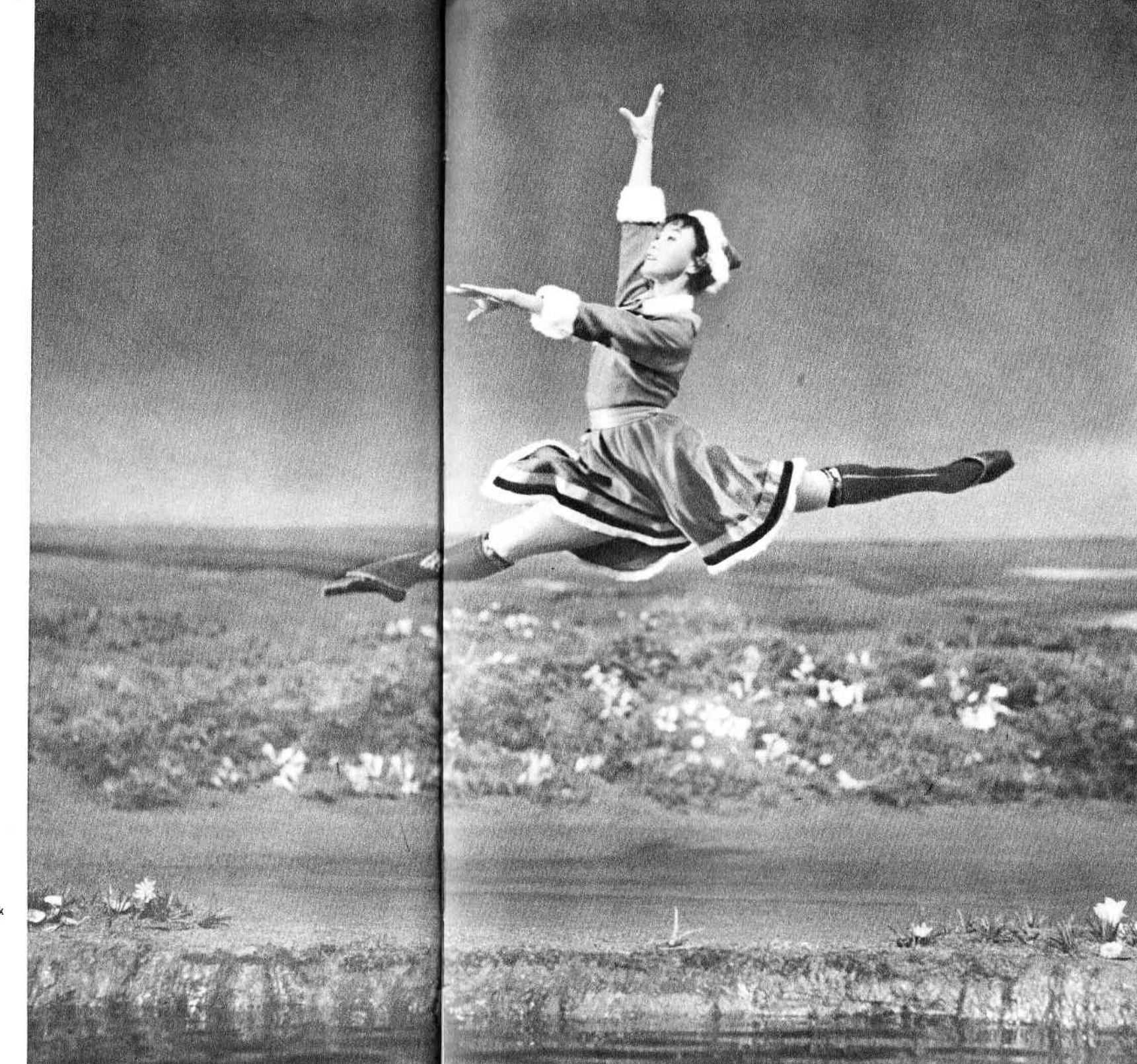
Schin chases after the flock