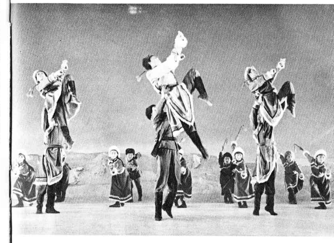
PLA men and herdsmen ride in search of the brother and sister