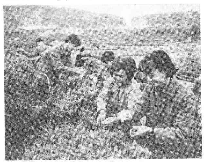
Members of The Peking Opera Troupe of Peking work with commune members

Performances of Revolutionary Theatrical Works for the Grass-roots Units: More than ten groups responsible for various modern revolutionary Peking operas, dance dramas and symphonies went to factories, mines, villages and army units to perform for the workers, peasants and soldiers. The items performed were mainly model theatrical works. Some new Peking operas such as Red Cloud Ridge, Investigation of a Chair, Fighting on the Sea and The Chingchiang Ferry were included too. During this period, these performing artists worked in the fields and factories and went all out to integrate themselves with the workers, peasants and soldiers.