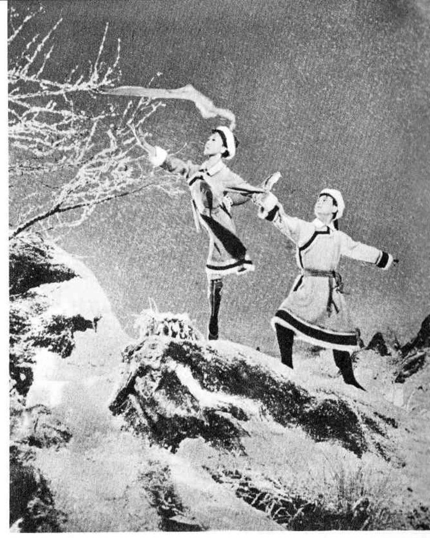
femur and Schin fasten a red scarf on a branch as a sign