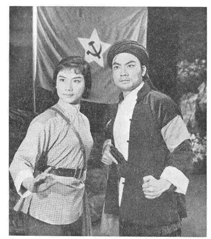
From the Kwangtung yuehchu opera Azalea Mountain

Stage Performances of New Theatrical Works: Various new works were chosen from items in the two theatrical festivals given by different provinces and regions recently held in Peking. Many of them are local and minority nationalities' operas adapted from