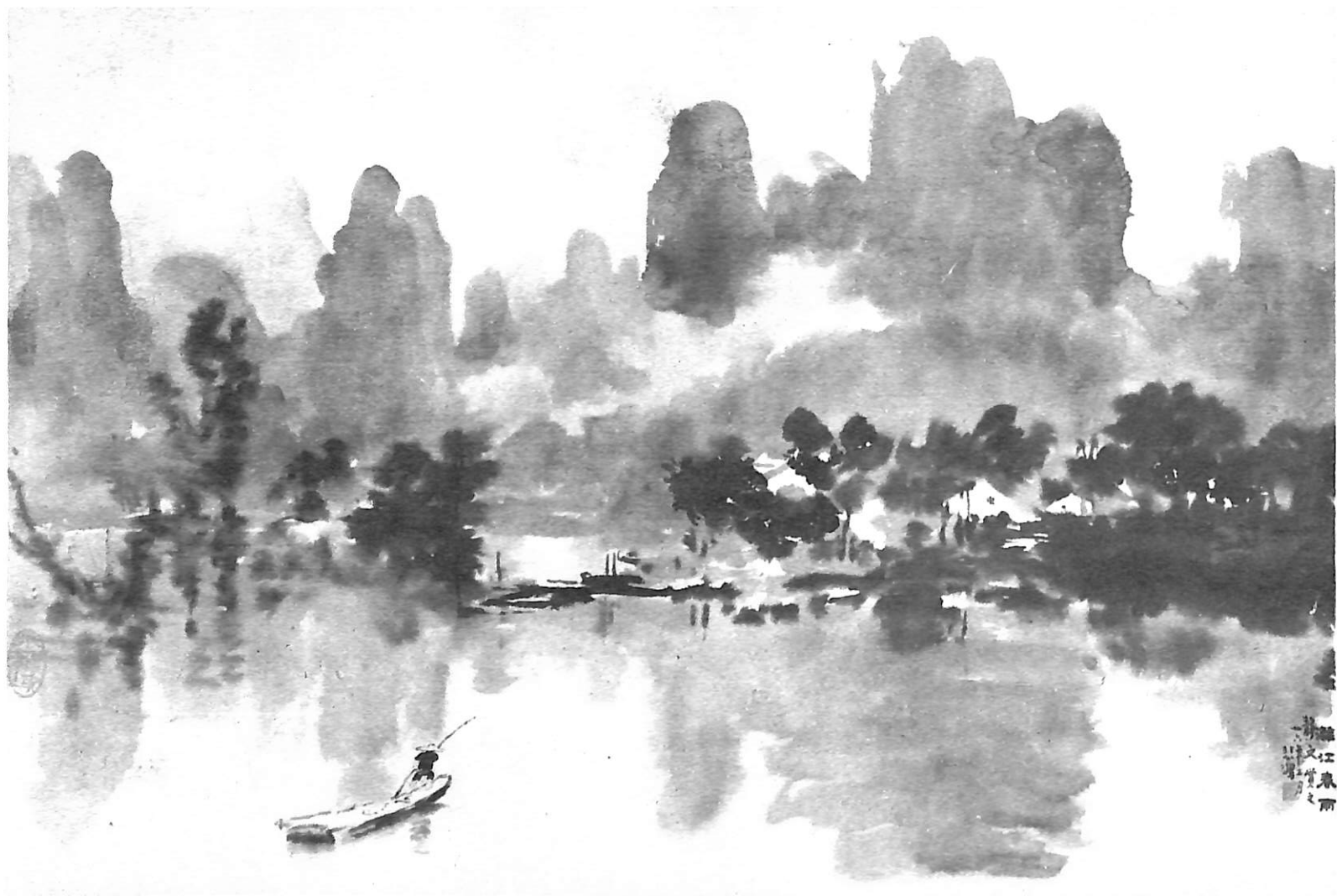
HSU PEI-HUNG: A Spring Shower on the River