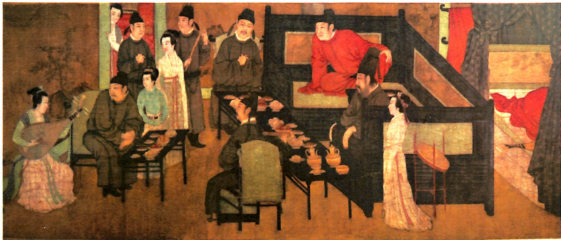
KU HUNG-CHUNG: An Evening Party (II)