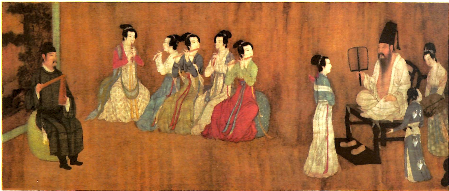
KU HUNG-CHUNG: An Evening Party (I)